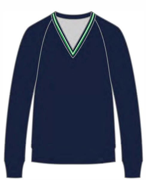
Navy V Neck Jumper with contrast trim (Compulsory)