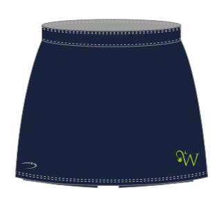
Skort with undershort (Compulsory)