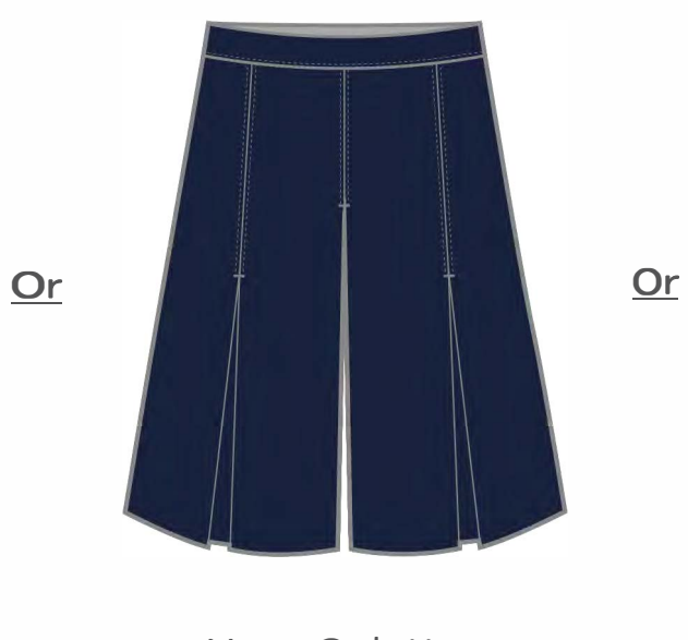
Navy Culottes (Compulsory)