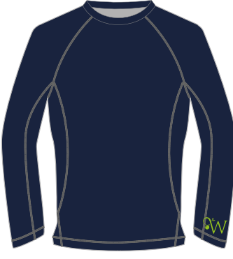
Baselayer Top -Climaskin (Optional)