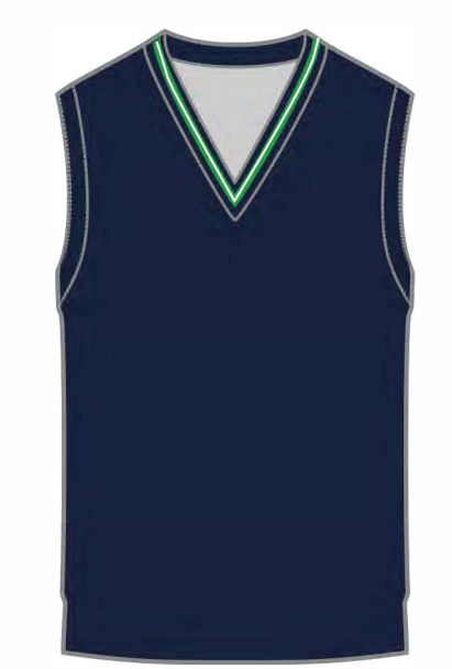
Navy sleeveless jumper with contrast trim (Optional)