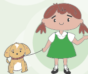
Respect & Responsibility