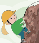
Resilience & Perseverance