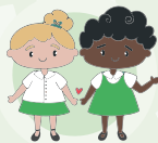
Cooperation & Kindness